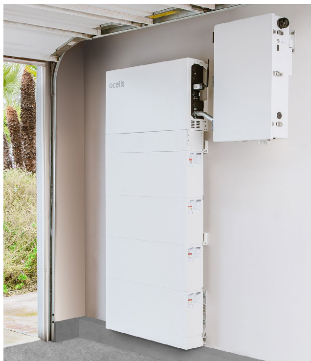
San Diego, CA homeowner installation

The flexibility of Q.HOME CORE enables a wide range of energy storage capacities to power home essentials and heavy loads. With the scalability to expand if your energy needs grow.